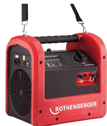
Shoulder strap for transport over longer distances