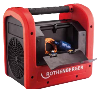
Practical storage compartment for accessories in the back