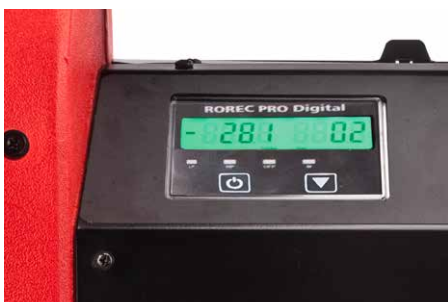
Clearly structured digital display